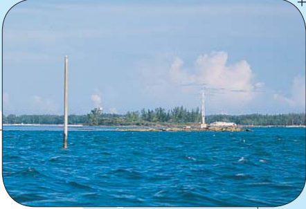
One of the pile markers at Indian Cay Channel is clearly visible in the foreground; the Indian Cay light can be seen behind it and off to the right, and beyond that is the northern shoreline of the west end of Grand Bahama Island. The water tower is to the left of center, almost shielded from view by trees. Unfortunately, all the pile markers have been missing since 2006.